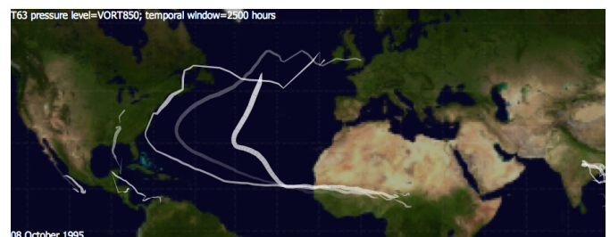
Fig. 2. Storm-tracks that initially form together, but subsequently diverge. Similar to those during last year's Atlantic season (2010).